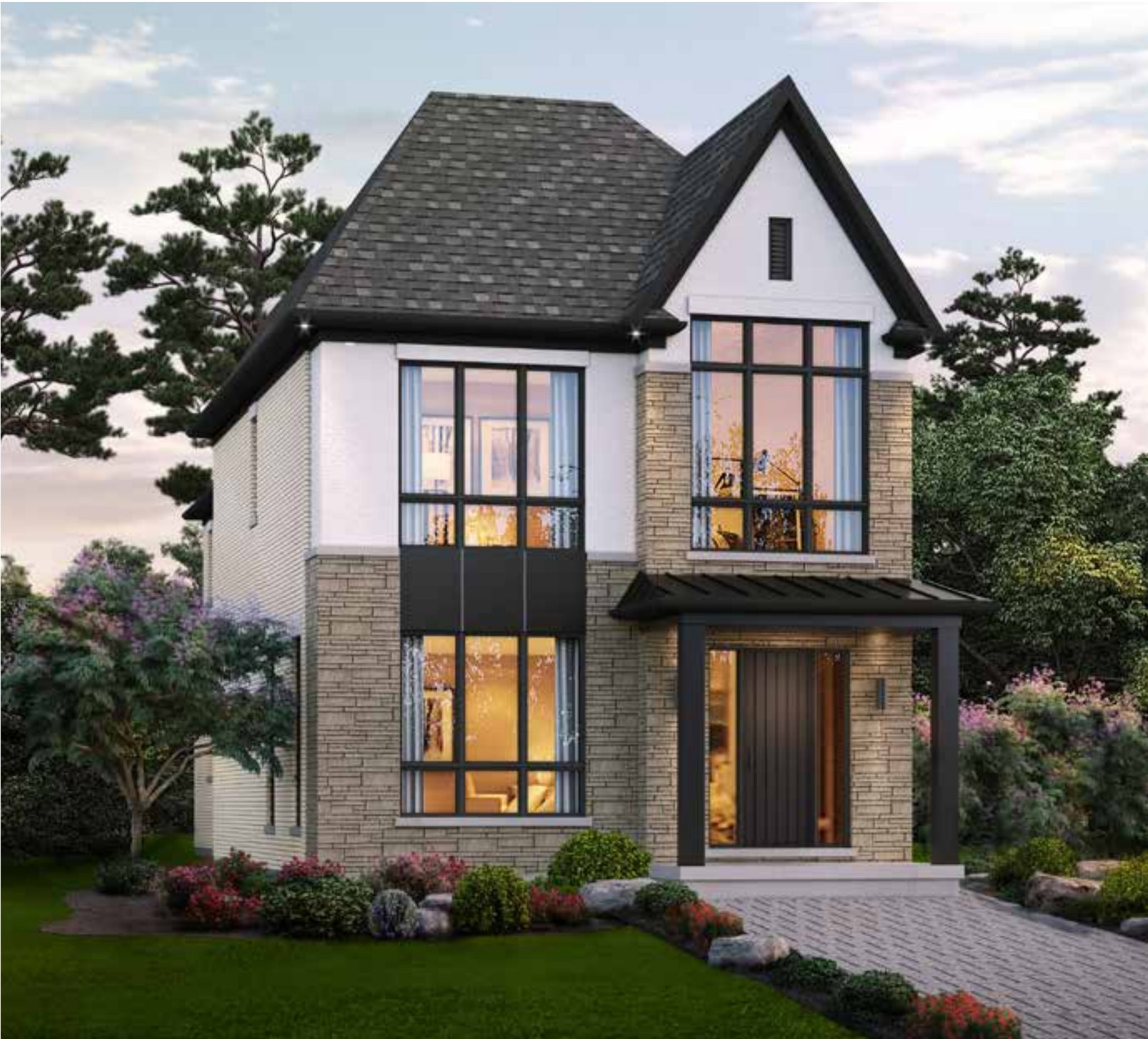
ELEV. A 2,500 SQ. FT. – 4 BEDROOMS / 3 BATHS, 1 POWDER