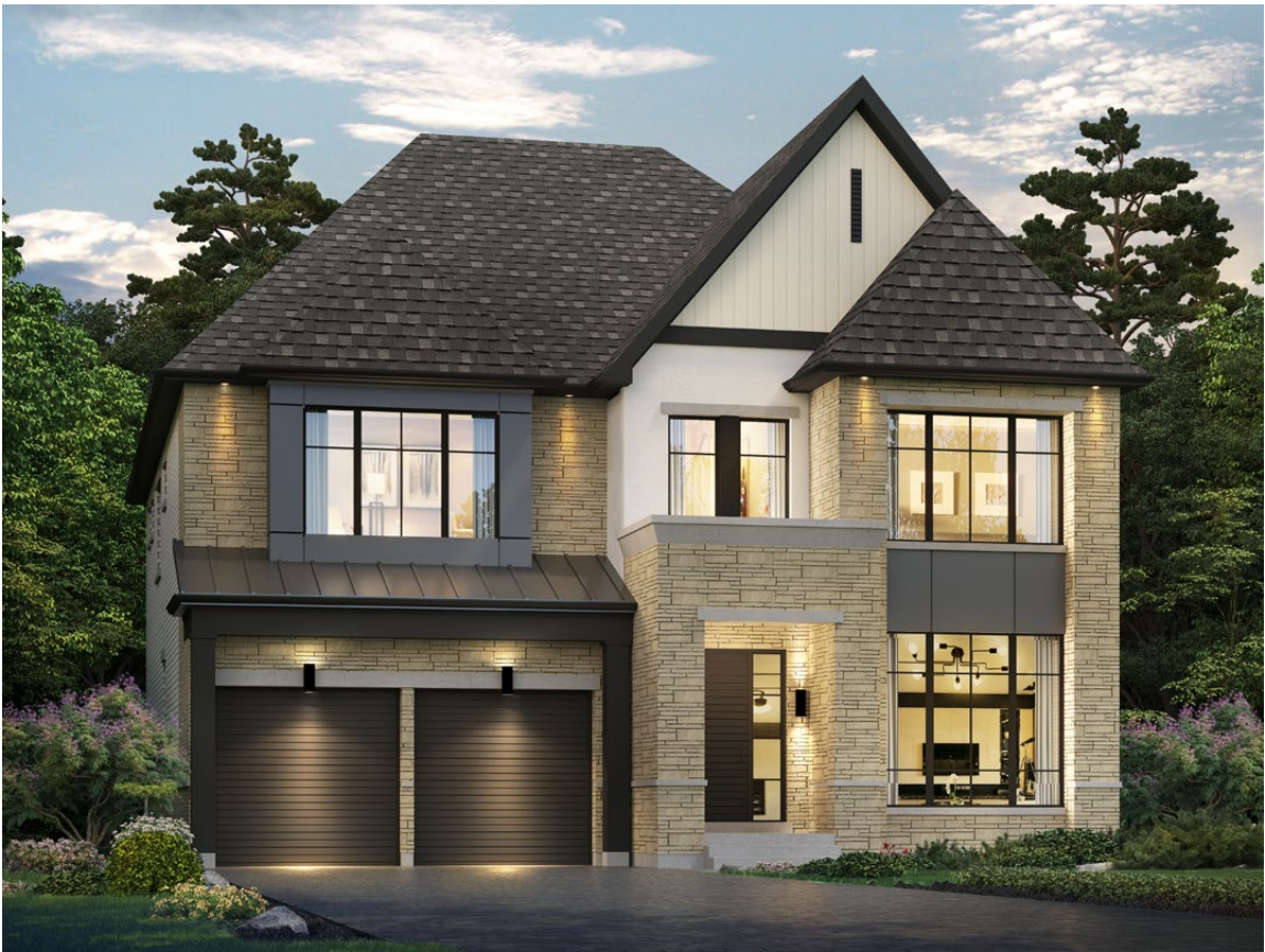
ELEV. A2 4,020 SQ. FT. – 4 BEDROOMS / 3 BATHS, 1 POWDER