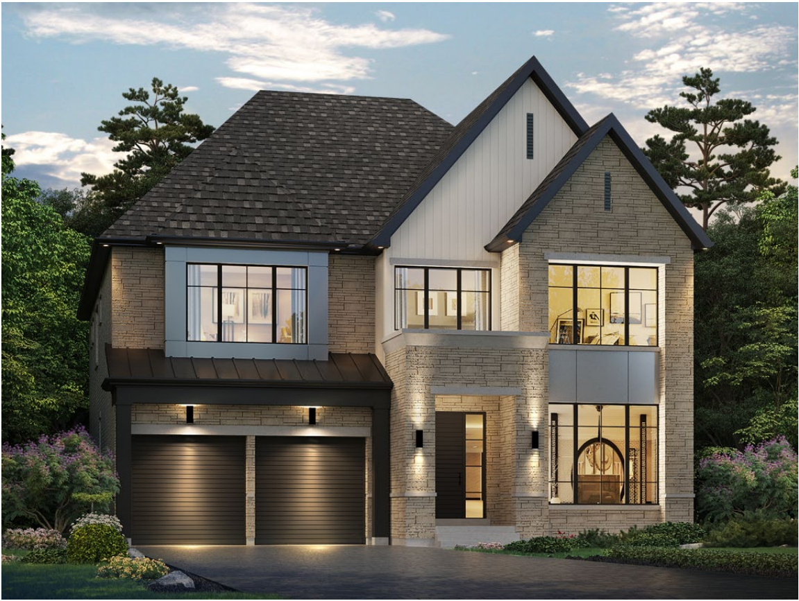
ELEV. A 4,020 SQ. FT. – 4 BEDROOMS / 3 BATHS, 1 POWDER